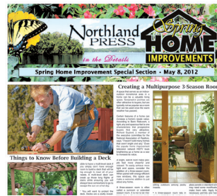
Spring Home Improvement April 19, 2022 (Deadline April 13)