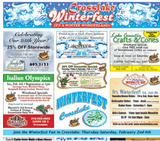
Crosslake Winterfest Jan. 25 & Feb. 1, 2022 (Deadline Jan. 19)