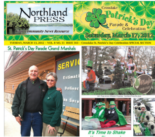
St. Patrick's Day Celebration March 8 & 15 2022 (Deadline Mar. 2)