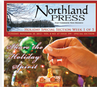
5 Weeks of Christmas November 22, 29, December 6, 13 20, 2022 (Deadline Wed. prior to publish date)