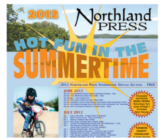
Summer Fun Guide June 21, 2022 (Deadline June 14)