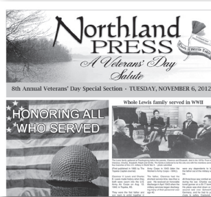
Veterans Day November 8, 2022 (Deadline Nov. 2)