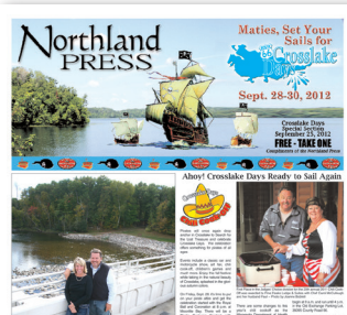
Crosslake Days* September 13 & 20, 2022 (Deadline Sept. 7)