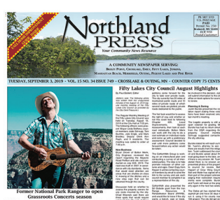
Fall Home Improvement October 4, 2022 (Deadline Sept. 3)